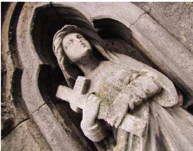
Sculpture on one of the elaborate tombs

From Victorian household names to post Second World War migrants, people from many walks of life and from many countries around the world have their final resting place in West Norwood. They include royals, inventors, artists, writers, soldiers and sports heroes. On this walk you can discover some of their incredible monuments and hear their fascinating stories.