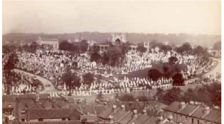
View of the South Metropolitan Cemetery (1891)

This walk explores the cemetery to find out more about some of the notable people buried here.