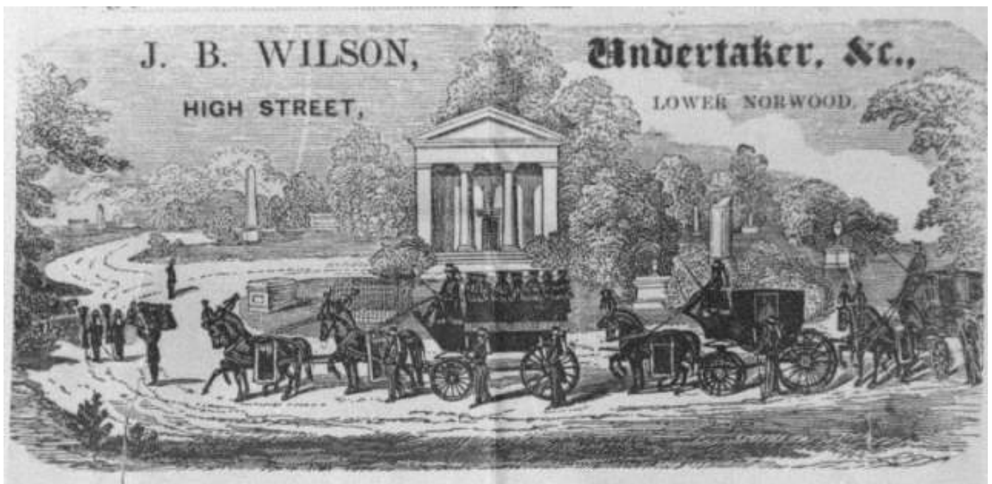
An advert for J.B.Wilson, Undertaker, Lower Norwood, showing a horse-drawn funeral procession at the cemetery (c.1905)